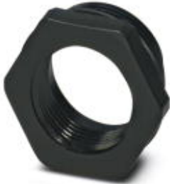
Reducing adapter, plastic, M32 to M20, including O-ring

Please be informed that the data shown in this PDF Document is generated from our Online Catalog. Please find the complete data in the user's documentation. Our General Terms of Use for Downloads are valid ( http://phoenixcontact.com/download )